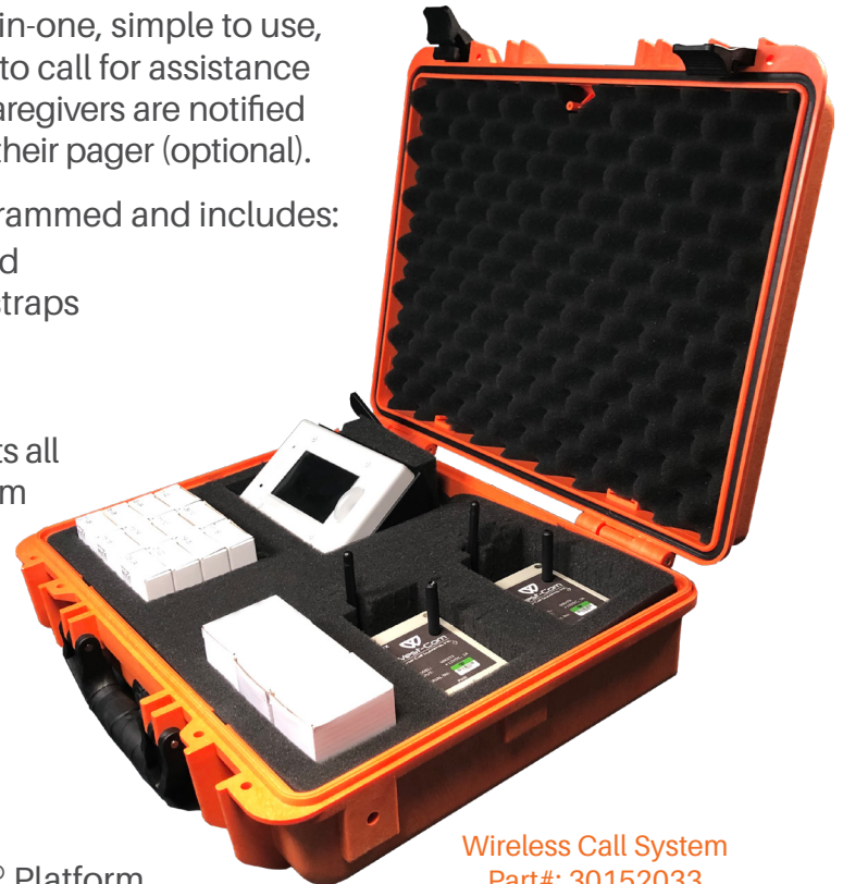
Wireless Call System Part#: 30152033