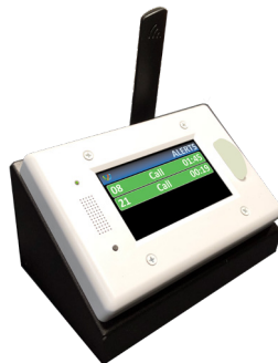
Desktop Digital Call Display